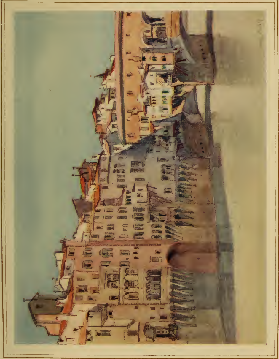
THE PONTE VECCHIO AND BACK OF THE VIA DE' BARDI